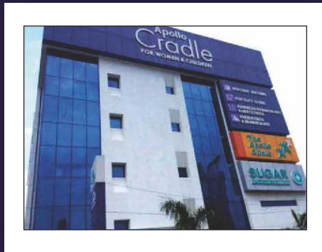
Apollo Cradle Maternity & Children's Hospital