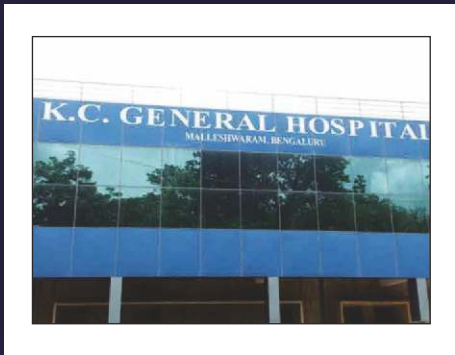
Govt. Hospitals in Bangalore

The College is attached to Government, Private Hospital & Research Center, which provides facilities for the practical exposure to the nursing students. The entire Hospital Complex of Hospital & Research Center with all its various facilities which includes medical Surgical, Pediatrics, Maternity and the specialties like Eye, ENT, Orthopedic, Dermatology etc. having bed strength of 1050 is used for the clinical experience of the students.