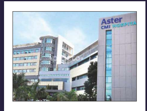
CMI Aster Multi Speciality Hospital