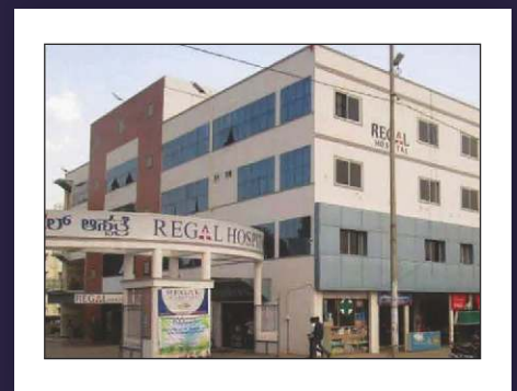
Regal Multi Speciality Hospital